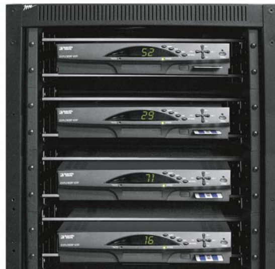
OCAP-3 (shown) uses three space model for greater heat dissipation, use two space model for high density mounting