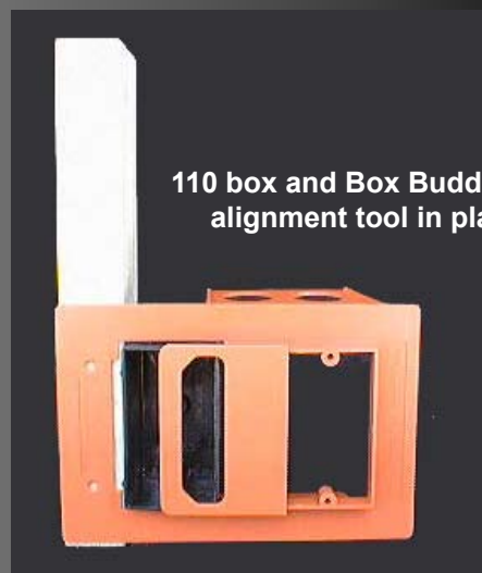
110 box and Box Buddy with alignment tool in place