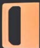
Pull-off alignment tool